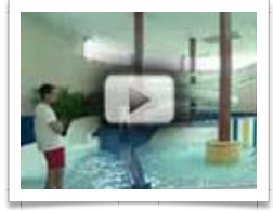
Dieppe swimming pool