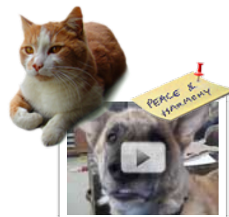
Woofs and purrs are welcome...