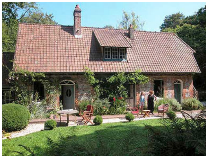
48 Route de l'Eglise, 76119 Varengueville-sur-Mer, France

La Maison du Vallon is a charming Normandy cottage, completely restored, dating back to the French Revolution. The house is built in clay, wood, silex and bricks, which is typical for the area. The living quarters cover 150 m 2 divided into two floors. The house which is totally furnished, has a 2500 m 2 garden, flanked by a brook and the famous flower park "Le Bois des Moutiers". The beach is at walking distance from the house.