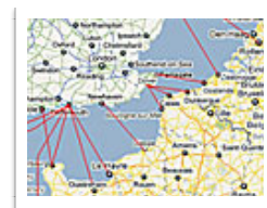
Cheap Dieppe ferries