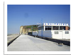
Services and sights

On the other side of Varengeville, in Pourville-sur-Mer, you have the “Huitrière”, where you can eat oysters and sea fruits on the terrace overlooking the sea (not to be missed). Further up, “Les Régates”, a bar/restaurant with a swinging atmosphere, also on the sea. And finally, our favourite: “Le Champêtre” in La Chapelle-sur-Dun, a tiny “bar-home-made-one-meal-brasserie-with-shop”: the lady of the house cooks one dish a day for the familiar crowd, while her husband serves Pernod in the small bar. It’s for sure an experience.