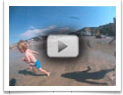
Playing on the beach

The agricultural area hides charming villages, which are well connected by a good road infrastructure. Good for bike rides. Birds, butterflies and squirrels, cows and horses complete the natural environment. The sky at night is a wonderfully full of stars. Nothing spoils the silence and peacefulness of the place.