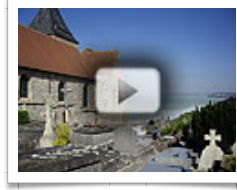
Sailors' graveyard and church

La Maison du Vallon is situated in Varengeville-sur-Mer, 10 km south-west of Dieppe in Northern Normandy, about three hours drive from Brussels. The village is well known for the artists that lived and worked there (Monet, Bracque – the last is buried at the church and sea cemetery at the end of our street).